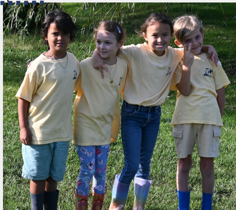
Lower students celebrating International Peace Day near the Willow Tree