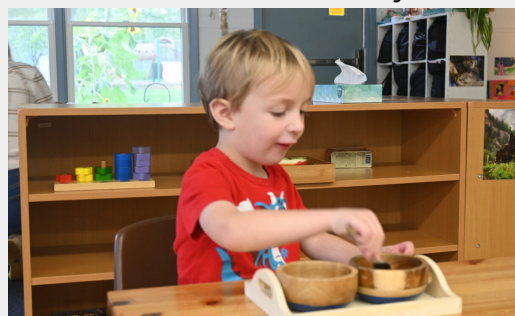
Beginnings students working on pouring and sorting skills.

The students in beginnings are young, which means there may be struggles adjusting to school early in the year. Being away from familiar things and having a space they share with others are some of the little ones' struggles. They may begin school barely speaking and by the end of beginnings many are talking a lot. Since they are so young, what do they learn about? In September, they learned about parts of an apple, crafts, independence and cleaning up after themselves. The beginnings students learn to pour water into cups. A key role of the beginnings program is to teach them to understand their emotions and to know themselves better. This sets them up to be a good member of their community.